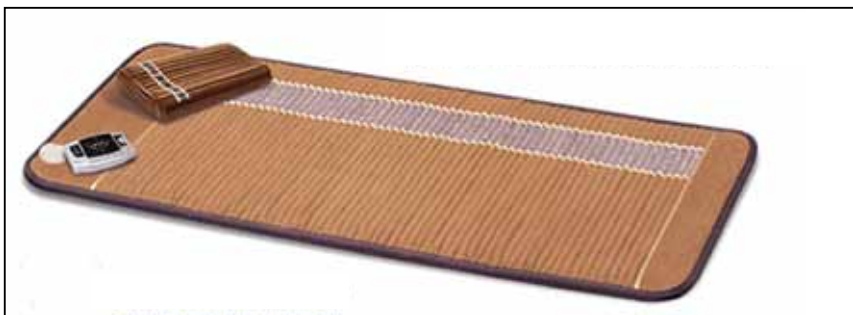
Figure 2 The amethyst BioMat and the Time/Temp control

as revealed in the ICAP brain scan and heart scan, as well as a reduction in cortisol levels.