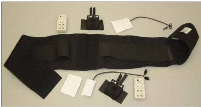
Figure 1) Infrared lower back pain wrap (MSCT Infrared Wraps Inc, Canada)

It contains an IR-emitting element in a unique design with an IR grid and buzz bars down each side to deliver the electricity, converting it to IR energy at a wavelength of 800 nm to 1200 nm.